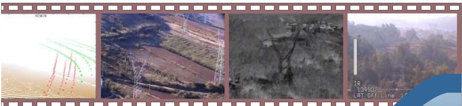
Line crossing reconstruction (LIDAR and image)