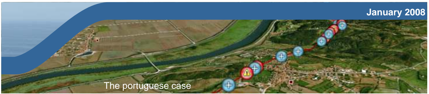
The portuguese case