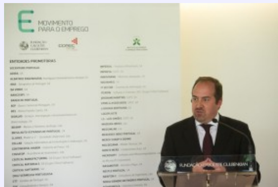
The Minister of Economy and Employment.

The program will kick-off immediately as 3200+ internships are already on offer. See movimentoparaoemprego.iefp.pt .