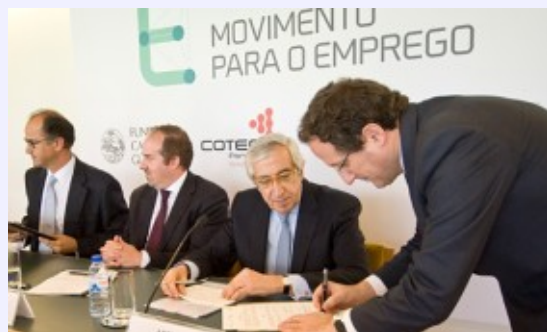
Signature of the protocol by the three parties.