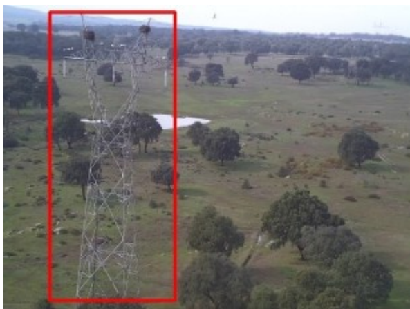
First step: Automatic detection of VHV towers